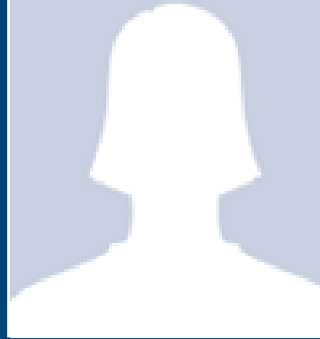
T.B.D. Apparently they are just waiting for you to invite them to join our club.

Who will you invite to join our fun group of amazing individuals that are dedicated to changing the world one child and one community at a time?