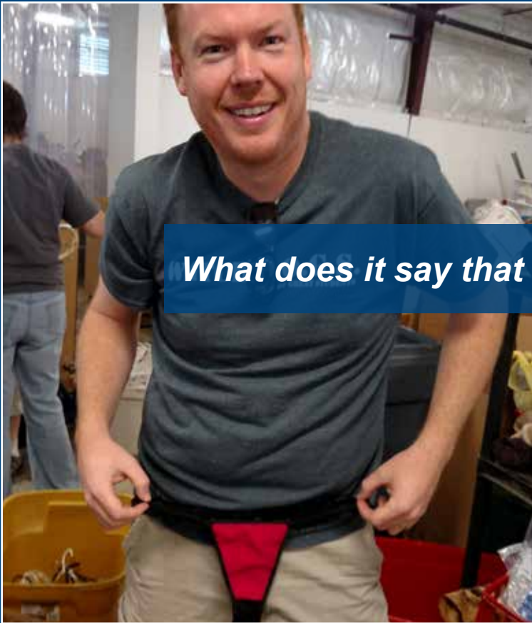
What does it say that he posed TWICE with this?